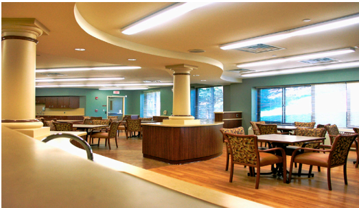
A view of the completed activity room and dining area.