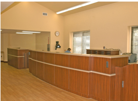
A view of the new nurse's station.