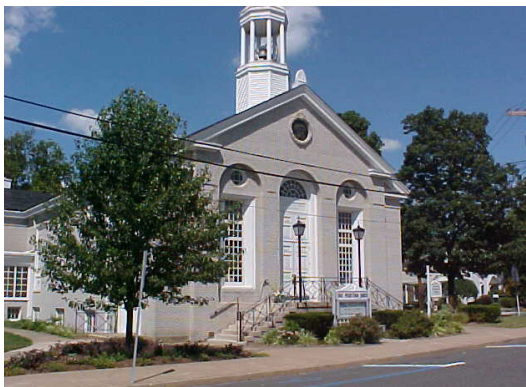
Existing front elevation of the First Presbyterian Church.