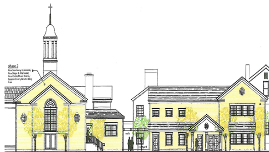
Rear elevation rendering.